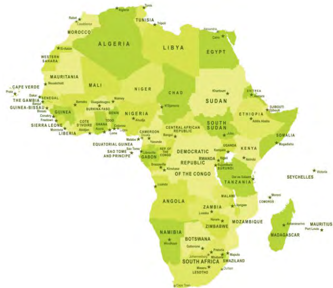
The True Size of Africa